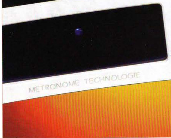
ABOVE: The broad display of the Kalista's partnering 'Ultra High Capacity PSU' shows nothing more than a blue LED

The Lars Erstrand band's 'Talk of the Town' track on this particular Opus 3 label sampler CD, taken from the album Erstrand Sessions , is a wonderful recording of a live jazz band in an intimate night club. I use it regularly to assess a playback system's ability to create a believable three-dimensional soundstage.